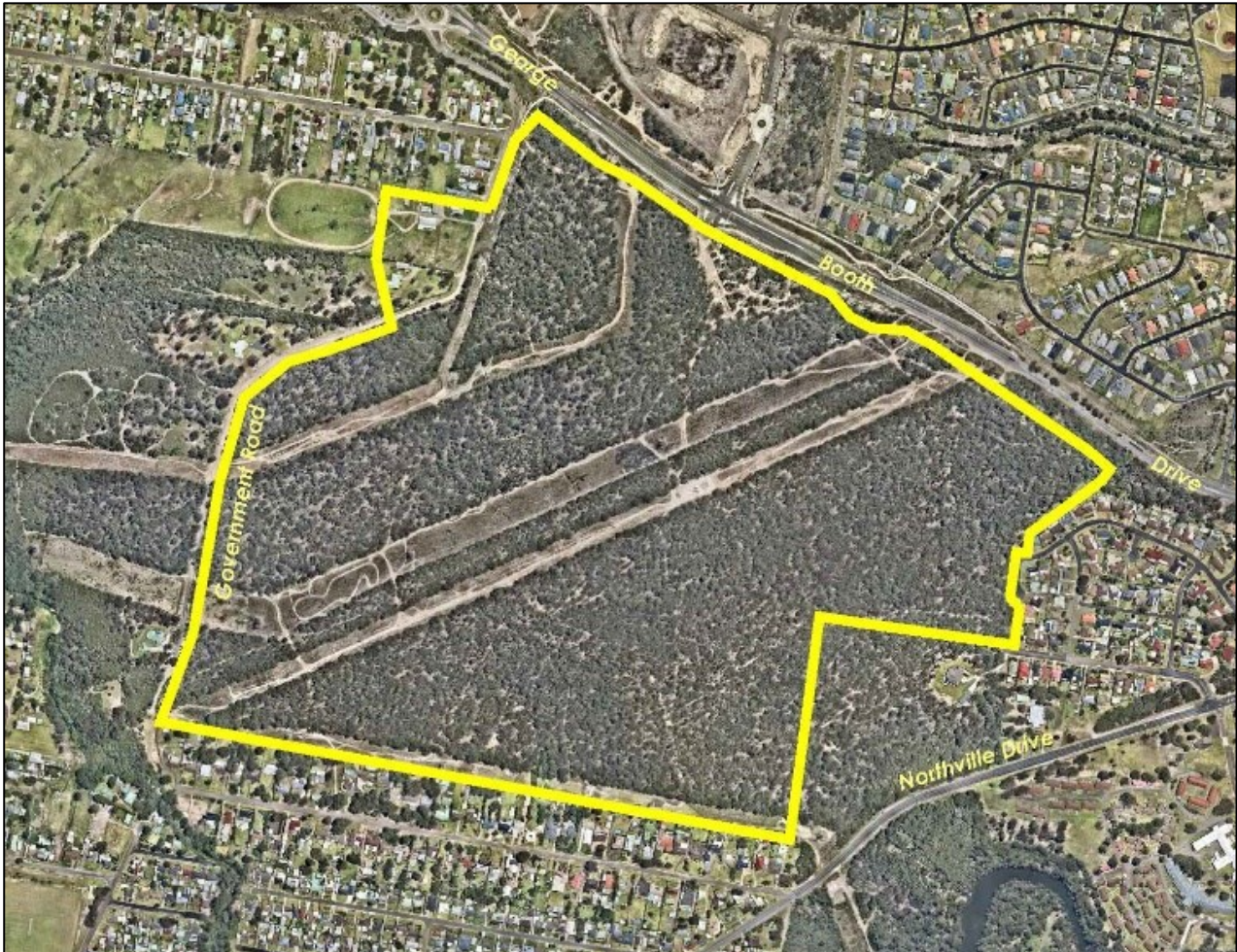
Figure 1 - Edgeworth Area 3 Precinct Area Plan Boundary